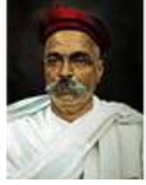
LOKMANYA BAL GANGADHAR TILAK