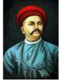
VAMAN SHIVRAM APTE